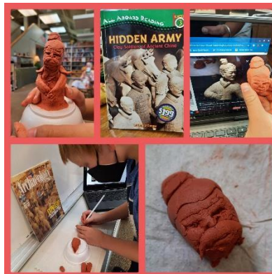
5th grade work on Ancient Civilizations

The kids have had a wonderful start of the year and are settling in nicely. We are looking forward to a wonderful year!